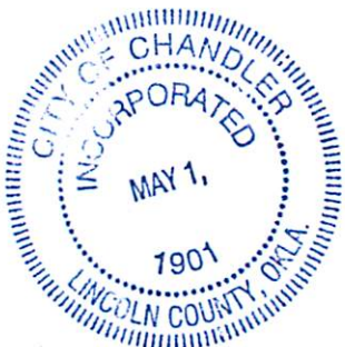
Gene Imel Mayor