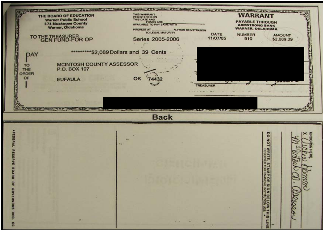
Exhibit "B" (continued)